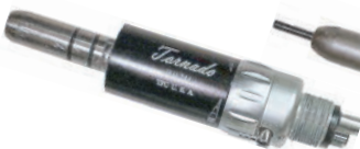
ELM744 Slow Speed Motor Retail $320 $225