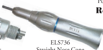
ELS736 Straight Nose Cone Retail $178 $125